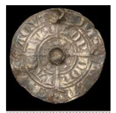
A silver brooch, fashioned from a groat (fourpenny piece) of King Edward I.

provided they are at least 300 years old when found, but if the coins contain less than 10% of gold or silver there must be ten or more to constitute Treasure. If they contain more than 10% precious metal then there need only be two. Only the following groups of coins will normally be regarded as coming from the same find: