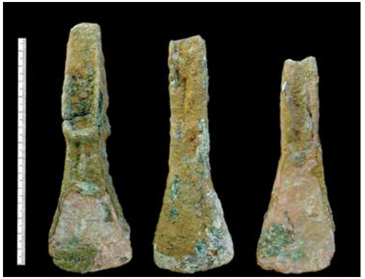
Three bronze axeheads of Middle Bronze Age date.

Once a find is claimed as potential Treasure it will go through an examination process to establish details of its age, composition and so on and a report will be produced by the relevant experts usually at the British Museum. This information is needed by the Coroner to establish at inquest whether the find is Treasure and as such the property of the Crown. If a museum has expressed an interest in acquiring a find it will proceed to inquest, if not the find