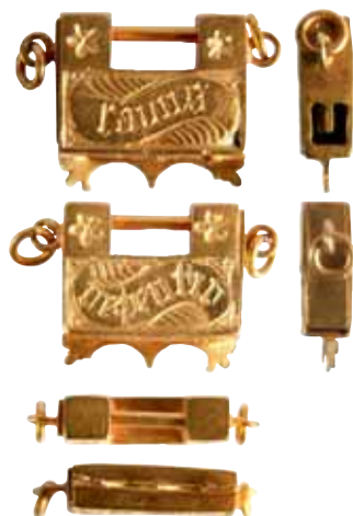
Gold miniature lock