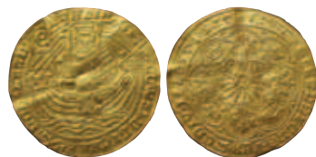
Edward I Rose Noble